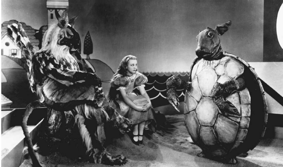
Cary Grant as the Mock Turtle in the 1933 film Alice in Wonderland .

two years younger. Alice's sister apparently is based on neither of the two other Liddells. If there is a historical character that Alice's sister is supposed to represent, it is probably Carroll himself.