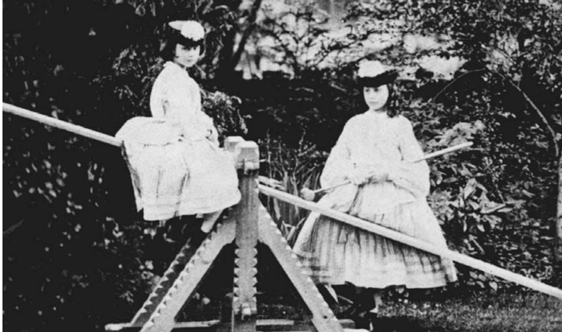
Alice Pleasance Liddell, inspiration for the title character of Alice's Adventures in Wonderland, pictured with her sister, Lorina Charlotte Liddell.

apologetic when she discovers she has offended someone, and she scolds the March Hare for his rude behavior. Nevertheless, Carroll seems to share the view that childhood was a golden period in a person's life. He refers in his verse preface to the novel to the "golden afternoon" that he shared with the three Miss Liddells. He also concludes the book with the prediction that Alice will someday repeat her dream of Wonderland to her own children and "feel with all their simple sorrows, and find a pleasure in all their simple joys, remembering her own child-life, and the happy summer days." On the other hand, Alice's own experiences suggest that Carroll felt that children's feelings and emotions were fully as complex as any adult emotions. By the end of the novel, she is directly contradicting adults; when she tells the Queen "Stuff and nonsense!" she is acting contrary to Victorian dictates of proper children's behavior.