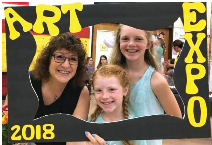
Johnson School Holds Annual Art and Writing Expo – see story and more photos on page 8.